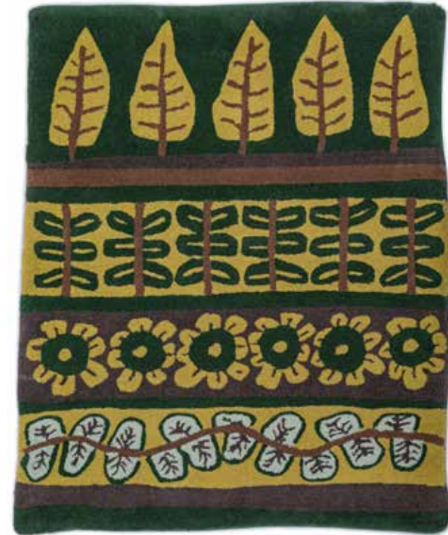
Flower Bed, 1.2 x 1.5 m