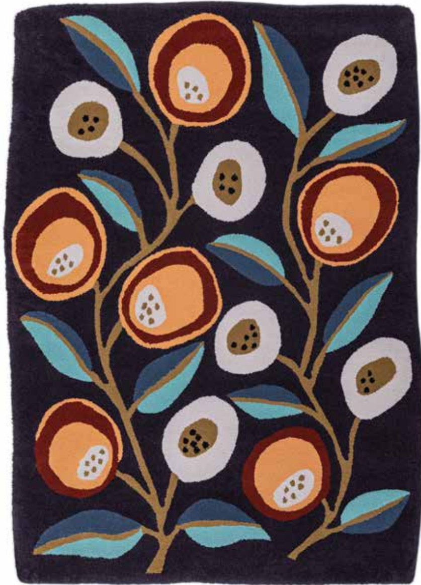
top: Bloom Room, 1.55 x 2.1 m right: Secret Life, 1.85 x 2.6 m