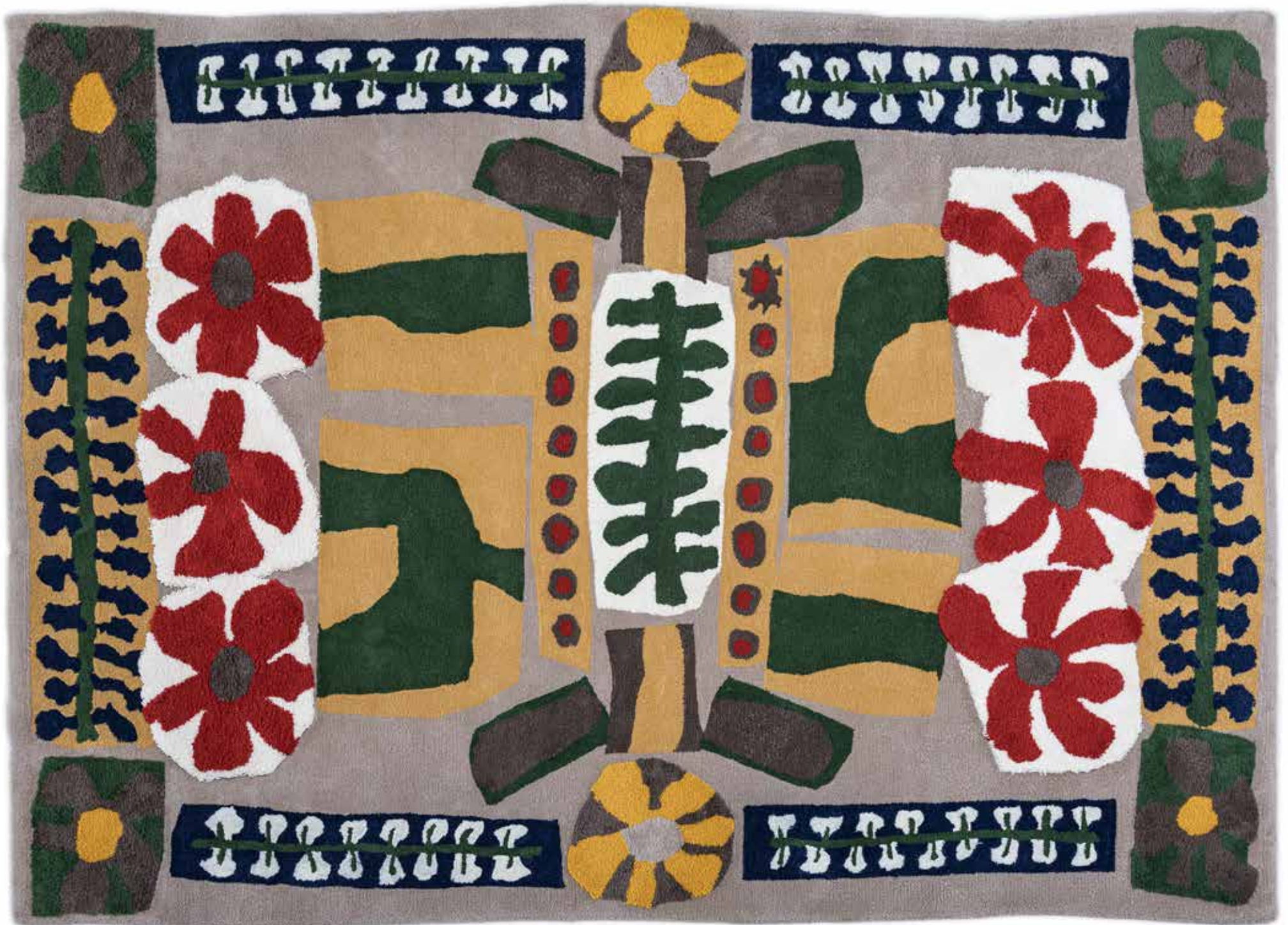
Inner Garden, 2.5 x 3.5 m