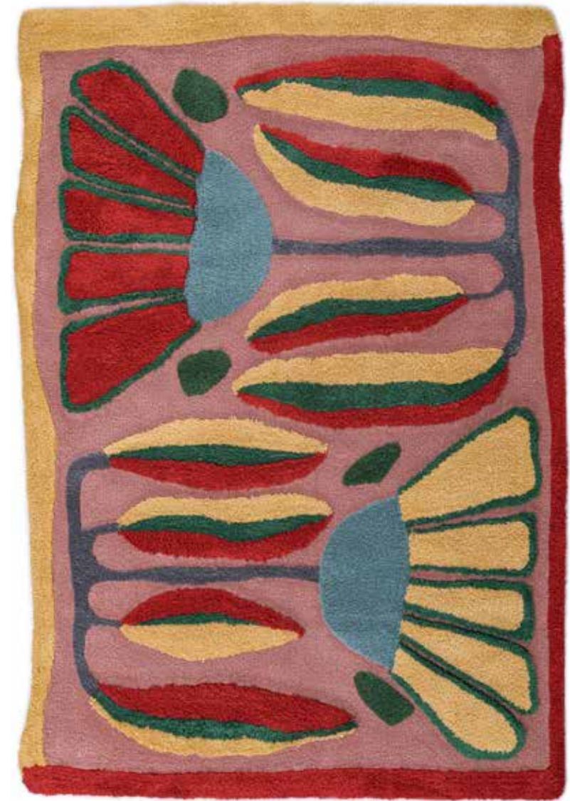
Twin Flowers, 1.55 x 2.15 m