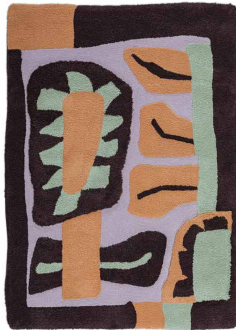
top: Botanical Abstraction, 1.55 x 2.1 m left: Forest Floor, 1.85 x 2.6 m